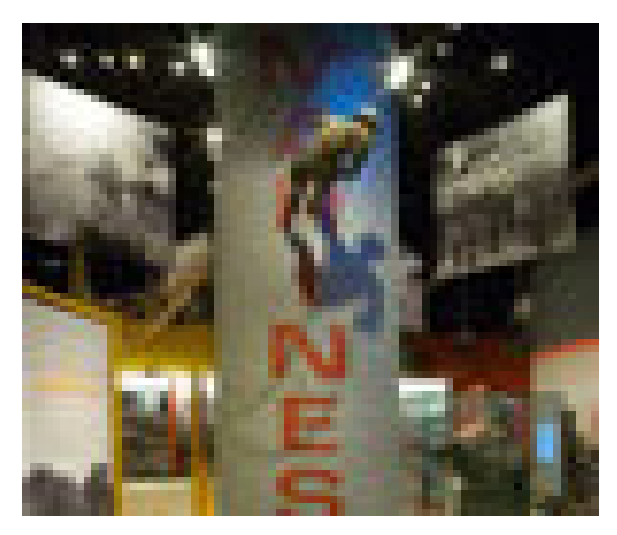
Making of Marines