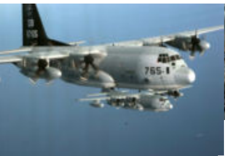
2 USMC C-130J's VMGR-352 in a training exercise