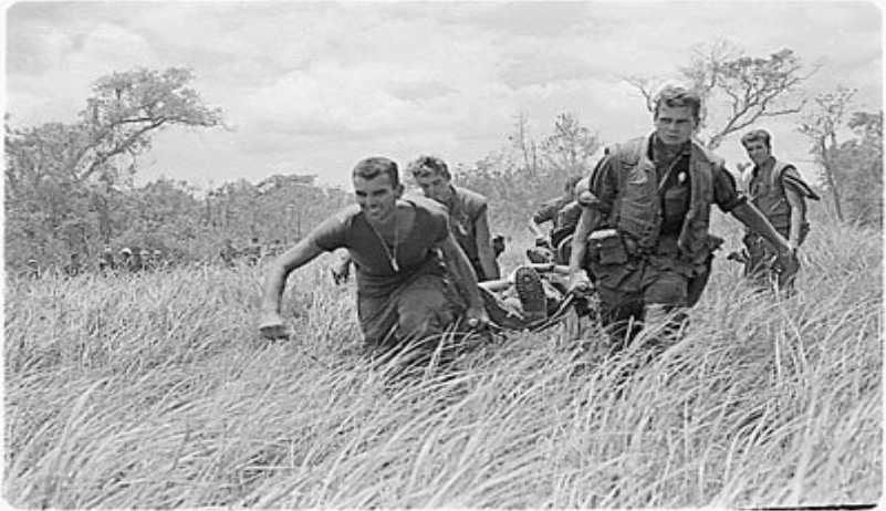
Vietnam. Medical Evacuation. Marines of Company E, 2nd Battalion, 9th Marines, while under heavy firefight with NVAs within the DMZ on Operation Hickory III, are carrying one of their fellow Marines to the H-34. 07/29/1967