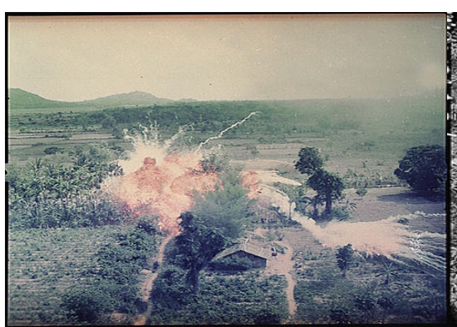
Napalm bombs explode on Viet Cong structures south of Saigon in the Republic of Vietnam. 1965