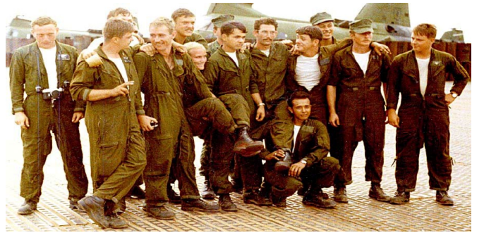
HMM165 Crew Cheifs 1969.