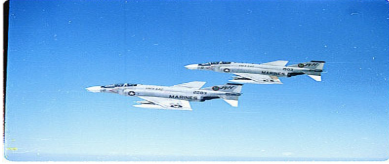
Vietnam. Two F-4b phantoms of VMFA-542, Marine Aircraft Group-11, 1st Marine Aircraft Wing, DaNang RVN, on their way to targets in support of Marines working in Northern I Corps. 01/1969