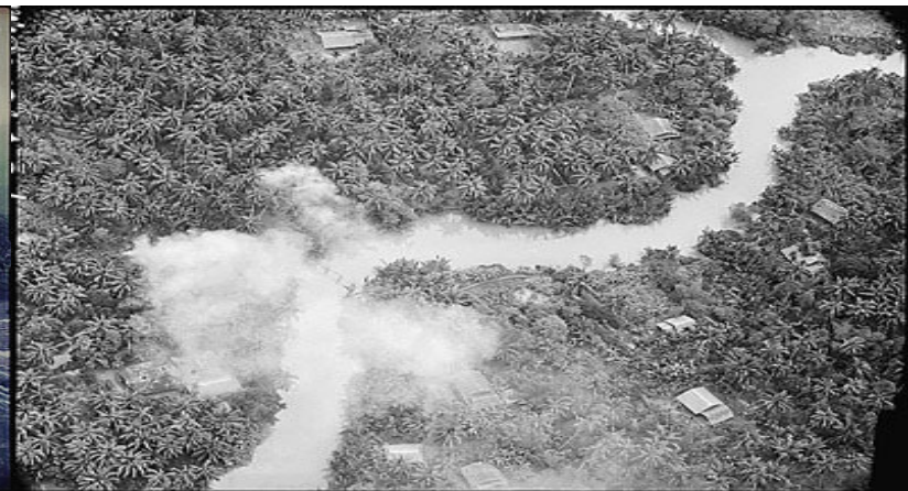
Bombing of Viet Cong structures along a canal in South Vietnam. 1965