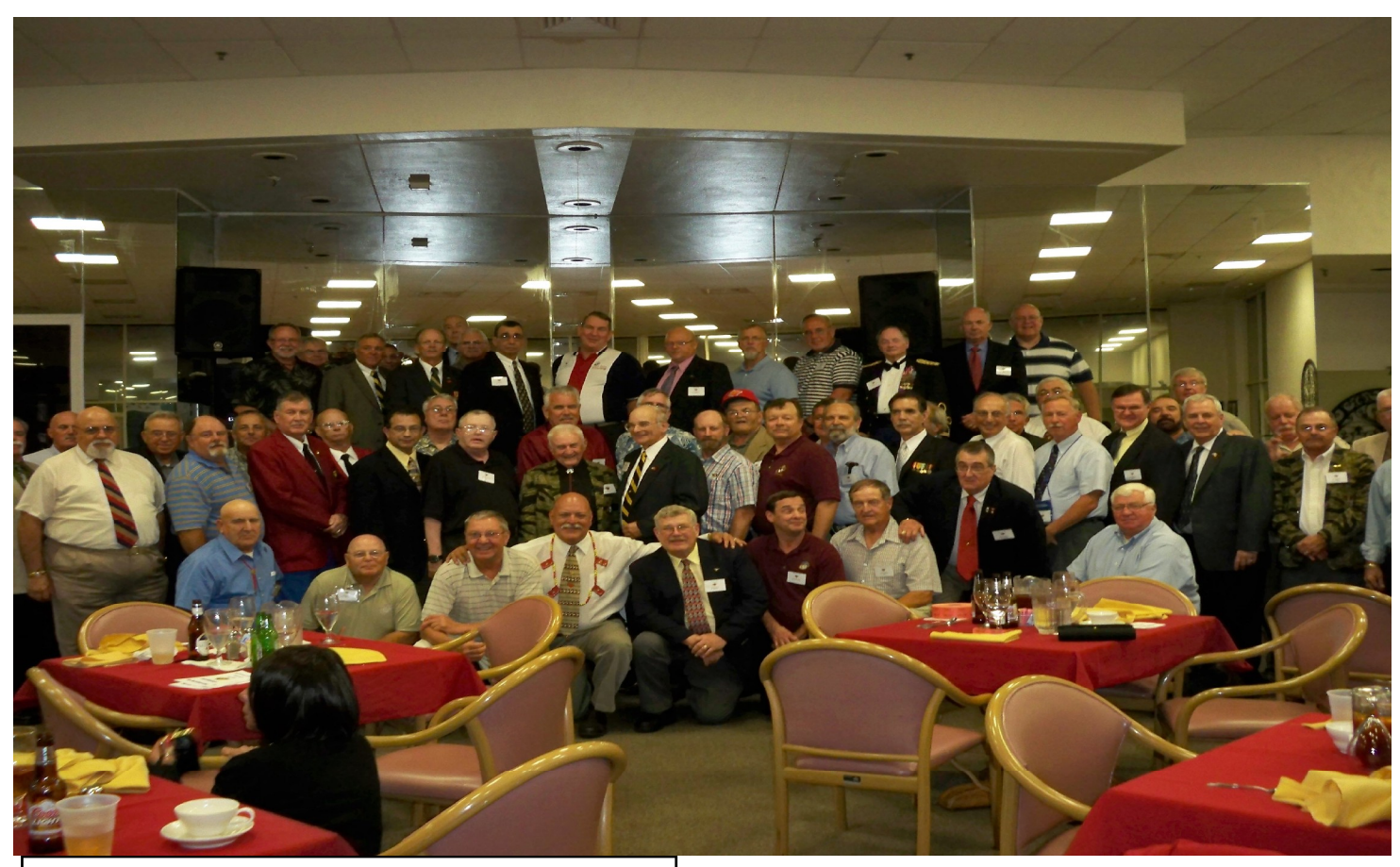
First Marine Aircraft Wing Association – Vietnam Service 567 Rivercrest Drive Woodstock, GA 30188

We are a fraternal organization of Marines and others who were attached to or supported First MAW units serving in the Vietnam War. The organization was founded in 1986 and incorporated as a not-for-profit entity in New York State in 1988. Our purpose is to reunite members of the First MAW either through scheduled reunions or by means of our newsletter, web site, or other various functions. The organization strives to disseminate information about our history as well as about legislation, entitlements, and welfare involving First MAW members.