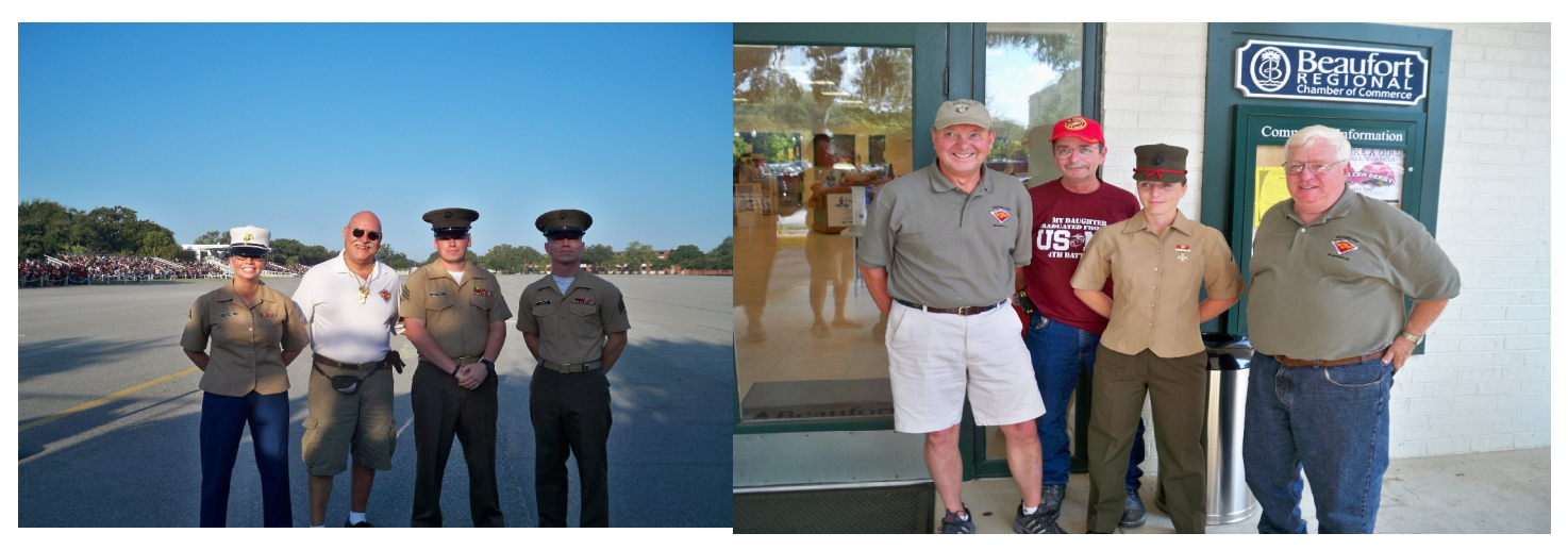
OLD AND THE NEW