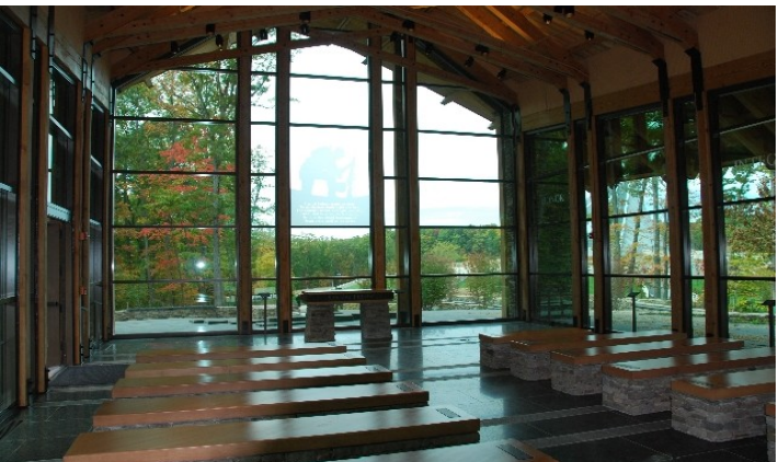
Interior view of Chapel

From its granite floor to the 16 pews constructed of stacked fieldstone with granite bench tops to the plain stone altar and natural cedar ceiling beams, the interior is dignified and calming, befitting a house of