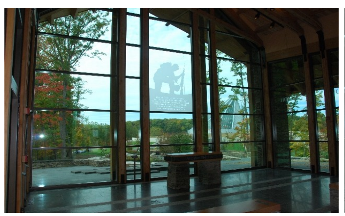
A Kneeling Marine at Prayer with the words of the Marine Prayer

Led a list of dignitaries who spoke at the dedication ceremony for the new Marine Corps Museum Chapel