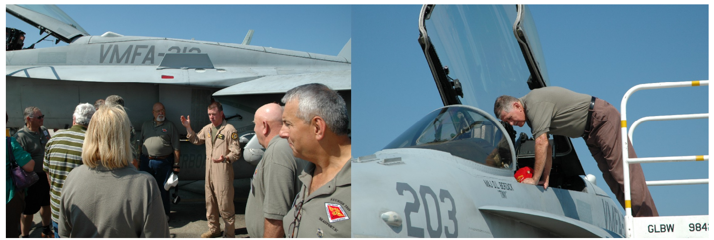
BEAUFORT AIR STATION