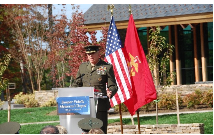
Commandant, Gen. James Conway

The Eagle, Globe and Anchor is etched on the glass wall above the main entrance. The MCB Quantico band played at dedication